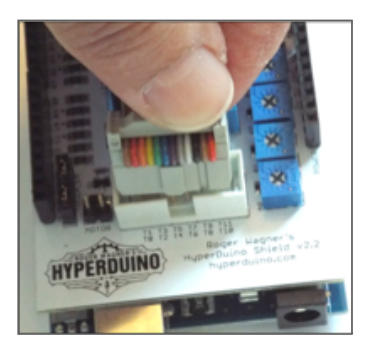
The Gray Block plugs into the WHITE BOX on the HyperDuino.

Be sure to notice the teeny triangle on the